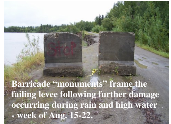
Barricade “monuments” frame the failing levee following further damage occurring during rain and high water - week of Aug. 15-22.

Recent levee damage from rain and high water --