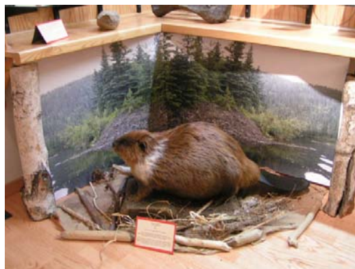
The new Beaver Dam display located in the trapping display.