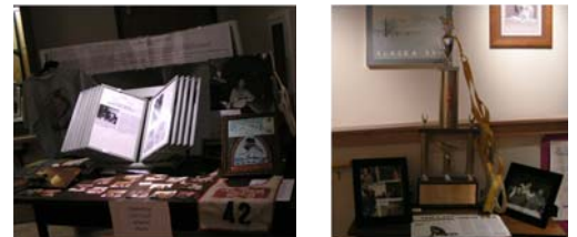
Local Iditarod racers share memorabilia.