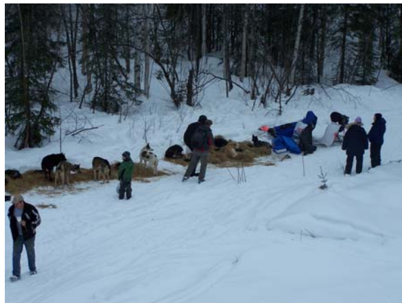
An Iditarod team rests and is cared for while at the checkpoint in McGrath.

Development Permit applications are available at the city office, which is required if you plan to build, renovate, add on, bring in fill material, excavate or make significant improvements to your property. The purpose of the Permit is to protect property and structures from flood damage by verifying that building activity is at least 2' above the Base Flood Elevation.